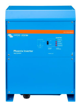
Phoenix Inverter 24/5000